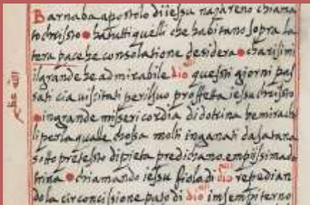
Evangelium apocryphum Barnabae, Vienna, Österreichische Nationalbibliothek Codex 2662 (XVI e s.), f. 26r

The Gospel of Barnabas is presented as the work of a companion of Paul. Preserved in Italian and Spanish manuscripts dating from the 16th and 17th centuries, it recounts the story of Jesus in a manner distinct from the canonical Gospels and shows similarities with the Qur'an in several respects. Is this text a reworking of an early Judeo-Christian gospel, or was it composed after the 14th century by a Muslim author? Are the Syriac texts discovered in Turkey or Cyprus reliable?